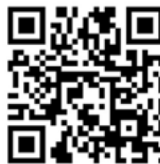
You Tube Channel