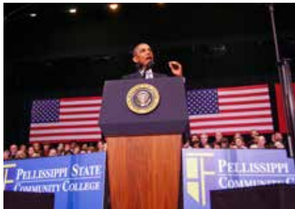
President Obama, January 9, 2015, Knoxville, Tennessee

The Tennessee Promise is having national impact and is changing financial access to technical and community college education across the nation. When President Obama visited Knoxville, Tennessee on January 9 it came on the nation's attention.